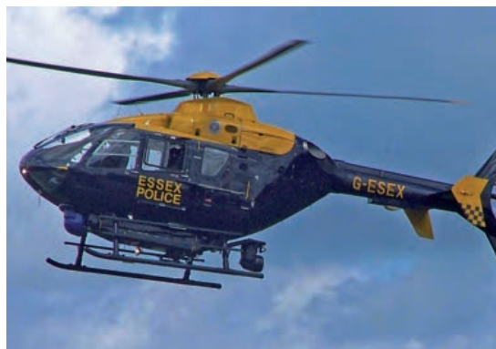
Airborne Law Enforcement