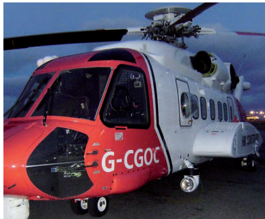
Search and Rescue

All elements of the Observer System, hardware & software are EASA ETSO C113 certified; FAA TSO Approval covers TSO-C113 Airborne Multipurpose Electronic Displays; TSO-C118 Traffic Alert and Collision Avoidance System (TCAS) Airborne Equipment, TCAS I, (Display functions only) and TSO-C147 Traffic Advisory System (TAS) Airborne Equipment, Class A (Display functions only). The hardware meets the requirements of RTCA DO160D and the software is Level D (RTCA DO178).