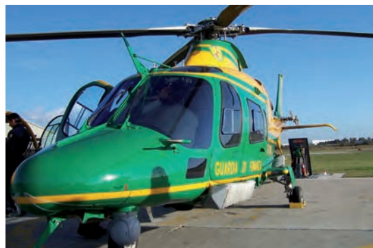
Border Patrol Role