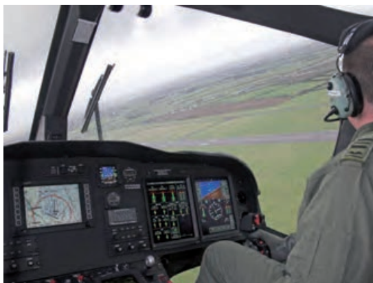
Front MFD Display