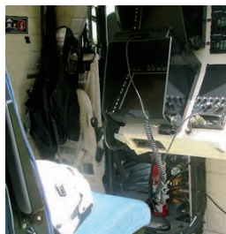
Rear Work Station