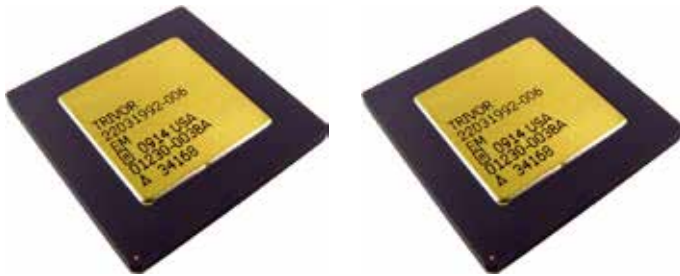
Land Grid Arrays