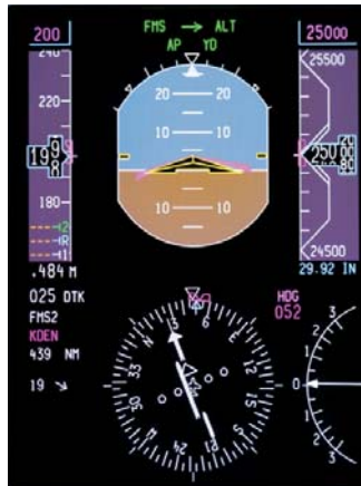
Bright, high resolution screen