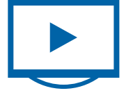
Real-time streaming of aircraft telemetry

As a fleet/charter operator, you get all of the above at unbeatable price levels ($2,000 for a block of 50 hours with no limit on data volume). BendixKing knows that achieving your business key performance indicators (KPIs) are of utmost importance. Talk to us and we will share the financial analysis with you and show the benefits to your business' bottom line. Assuming that availability of Wi-Fi results in 2 more flights per month, and using industry average data, our analyses show that a charter/fleet operator can benefit from an ROI of 106% and a payback period of 11 months with the purchase of an AeroWave 100 plus the payments of the monthly service fee.