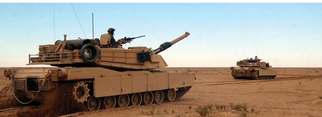
Directed Energy Weapon Solutions