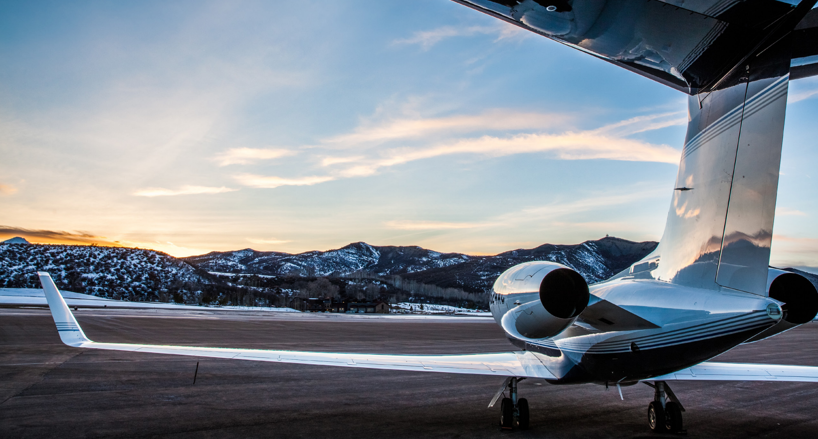
Aspen-Pitkin County Airport