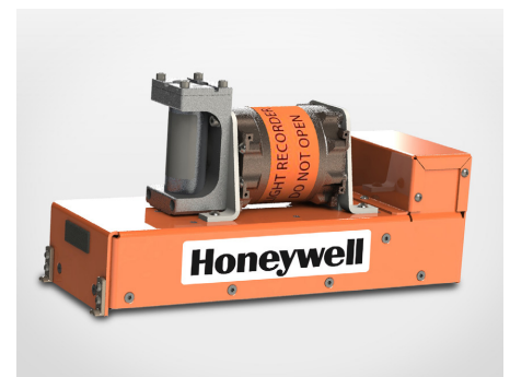
HCR-25 Cockpit Voice Recorder (CVR)

HCR-25 will be RTAR (Real Time Access Recorder) ready and enabling of this function can be done by simple software on the wing application.