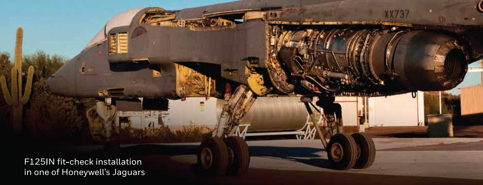
F125IN fit-check installation in one of Honeywell's Jaguars