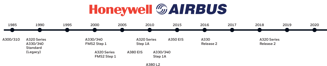
Figure 4: Honeywell Airbus FMS Evolution Timeline

The Honeywell Airbus FMS software has undergone significant evolutions since the first version was certified on the A300/310 in 1986. In the 30 years of joint development of best-in-class FMS on all Airbus airline transport aircraft, many innovations have been incorporated in the baseline that has evolved into the current Pegasus FMS for the A320 series and A330, and the new derivatives that have become the standard (sole source) FMS on the Airbus A380 and A350. The driving force behind the feature and functionality insertions result from both changes within the airspace and innovations that result from Honeywell’s unparalleled breadth of airline transport FMS offerings and industry leadership. Figure 4 below provides a timeline showing the Honeywell Airbus FMS evolutions on the A300/310, A320 Series, A330/340, A380 and A350 covering the entire Airbus fleet, legacy and active model base.