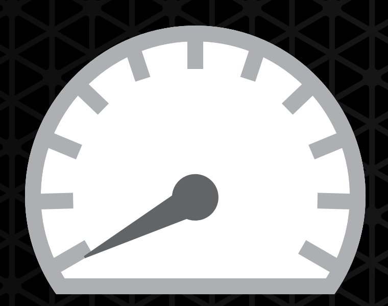
Iridium 2.4 kbps