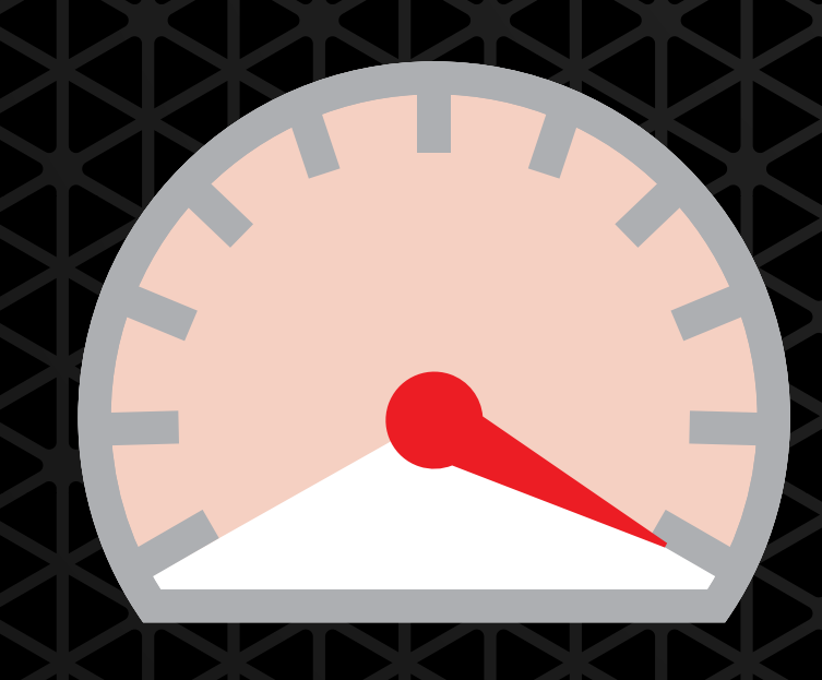
JetWave (Ka-Band) Up to 50 Mbps