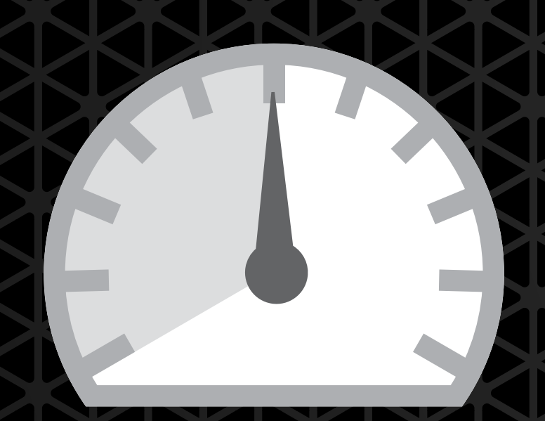
Ku-Band Up to 25 Mbps