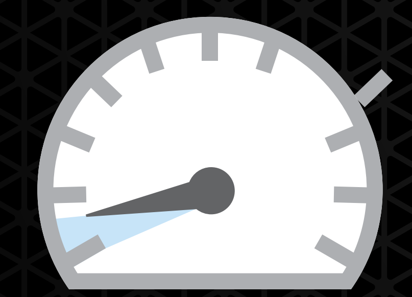
SwiftBroadband Without HDR*