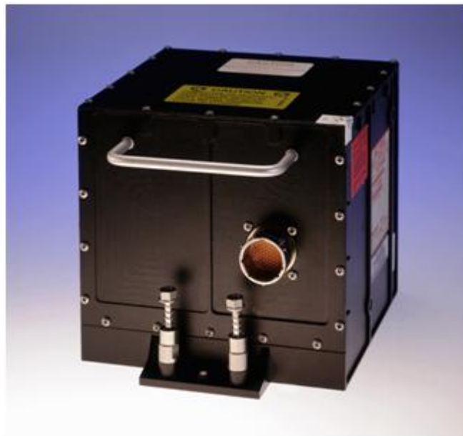
Micro Inertial Reference System