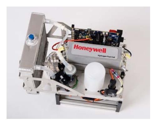
600U Fuel Cell Power System