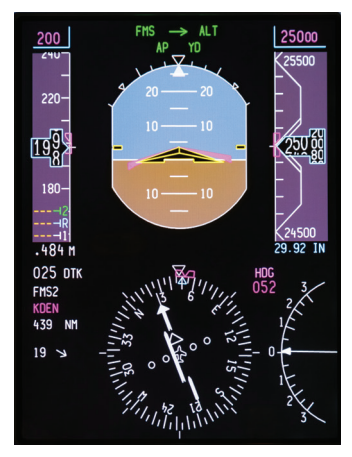
Bright, high-resolution screen