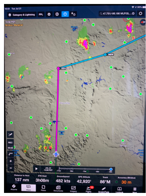
The RDR-7000 weather image was extremely accurate throughout the storm-chaser series of flights in Captain Skoog's Falcon 900EX.