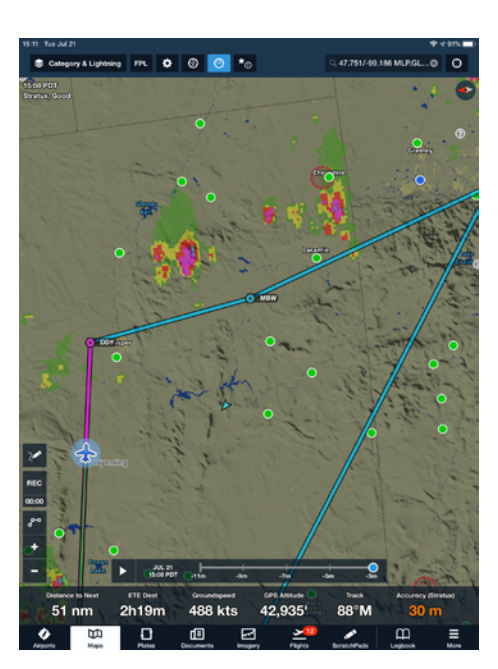
To test the radar's accuracy, an ADS-B weather image was used to compare a known weather source to the RDR-7000 radar image.