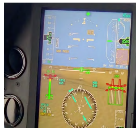
Mode 3B, a reduction in airspeed to below 55 kts after attaining 60 kts generates a visual caution and aural “Check Airspeed”

Update to version -036 can be made on wing. A verification procedure is supplied along with the media containing the software update. Resulting top level part number is 965-1595-036.