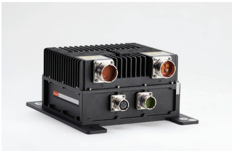
Ka-Band Aircraft Networking Data Unit (KANDU)