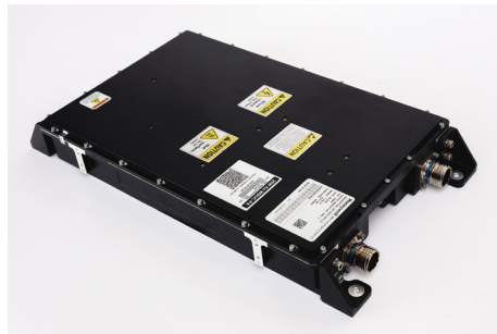
Block-up Converter (BUC)