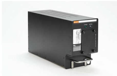
Modem Manager (Modman)